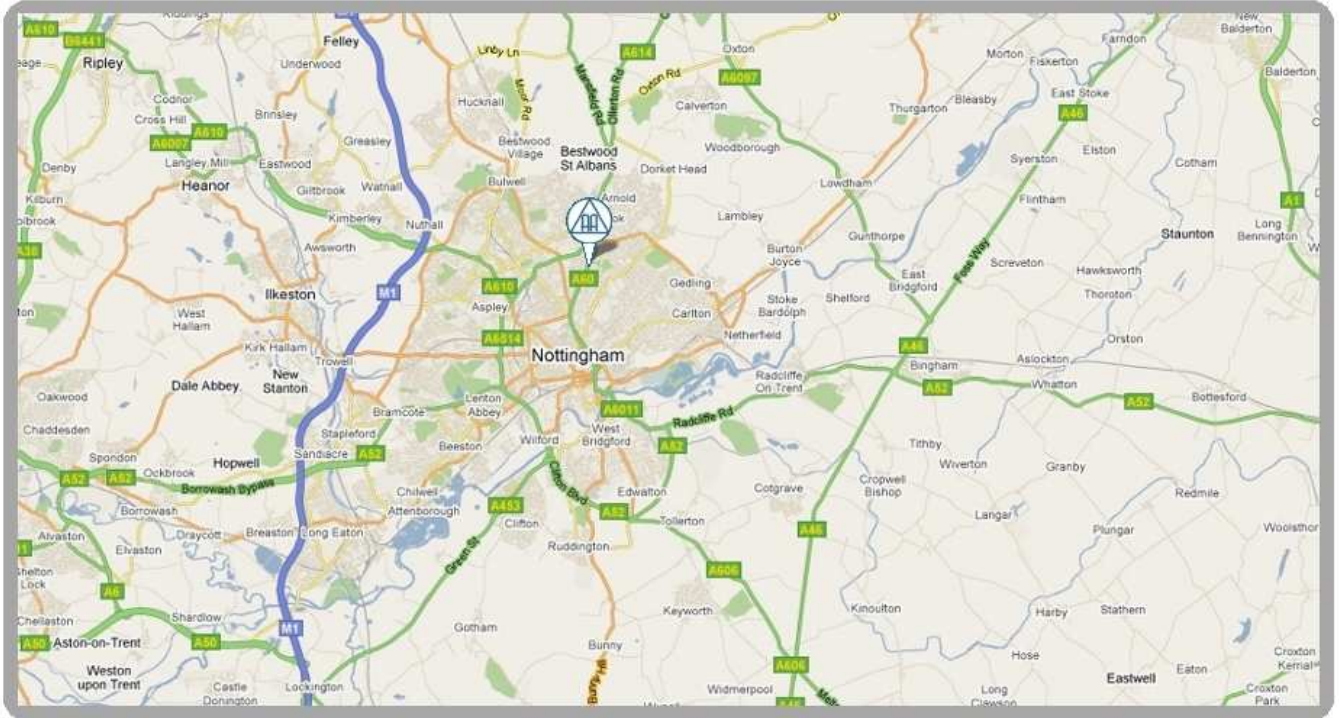
Figure 1: Small Scale Map

SHERWOOD COMMUNITY CENTRE = MANSFIELD ROAD, SHERWOOD NOTTINGHAM NG5 3FN